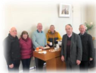
Some of our parishioners enjoying the pancake morning