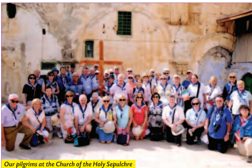
Our pilgrims at the Church of the Holy Sepulchre

Our pilgrimage began in Jerusalem. Good Friday will never be the same again after walking the Via Dolorosa through the crowds, sights, sounds and smells of the Old City. The Church of the Holy Sepulchre is a little underwhelming, until you enter and join thousands of Christians from all over the world in a space that has been sacred for over a millennium. Amidst all the tumult, off to one side, there was a monk - alone with his prayers. Travelling by coach from Jerusalem to Galilee, we reflected that Mary and Joseph had a very long journey by donkey to register for Caesar Augustus's census. Galilee is a very different place, more spiritual in some respects. Sailing on the Sea of Galilee, and visiting many of the places where Jesus taught, gave us an insight into the environment that informed His teaching. Our pilgrimage came to a fitting end with unscheduled final mass at Magdala where we stopped en route to the airport.