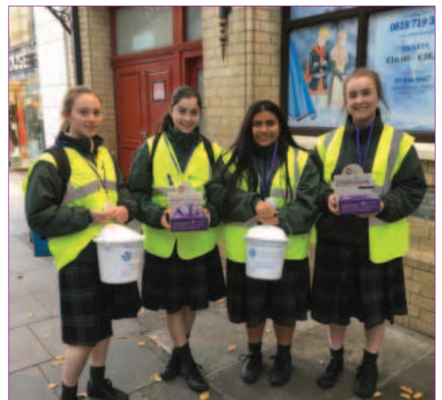
Loreto Beaufort Transition Year students fundraise for the Alzheimer Society of Ireland in the City Centre