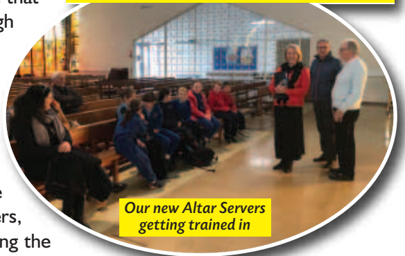
Our new Altar Servers getting trained in