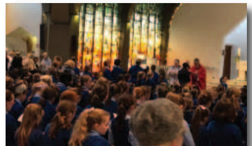
Scoil Naomh Pádraig girls join our parishioners at 10am Mass for the beginning of the School Year