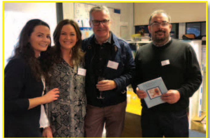
Wonderful evening to celebrate the 50th anniversary reunion at Ballyroan Boys School with teachers and past pupils