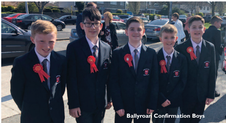
Ballyroan Confirmation Boys