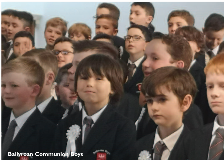
Ballyroan Communion Boys